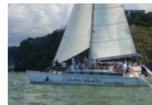
SUNSET CATAMARAN CRUISE AT THE BOARD RETAILER SUMMIT.