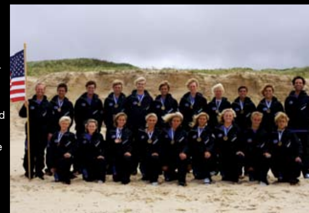
THE PACSUN USA SURF TEAM PLACED 4TH AT THE 2008 QUIKSILVER ISA WORLD JUNIOR SURFING CHAMPIONSHIPS.