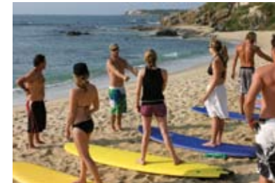
TEACHING FIRST TIME SURFERS AT OLD MAN'S DURING THE TRANSWORLD SURFARI