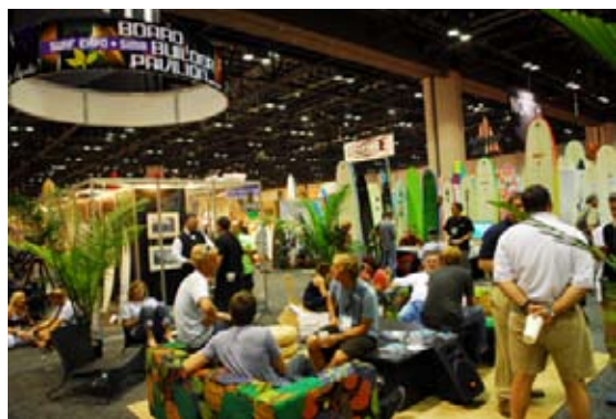
SIMA/SURF EXPO BOARD BUILDER PAVILION AT SURF EXPO'S JANUARY 2008 SHOW.

September's show is coming up fast, and we are excited to announce that our buyer pre-registration is up from last year. New shops are registering with us every day and current shops are being sure to take advantage of our expanded seminar series and our Retail Center, sponsored by the Board Retailers Association. Initial feedback has told us that with gas prices going up, reps just can't make as many stops. Shop owners are filling in spots behind the registers and out on the floor and just can't afford to stop selling to shop a line. Our show is an order-writing show, and now, more than ever, retailers intend to use the show to get down to business with you on the show floor this