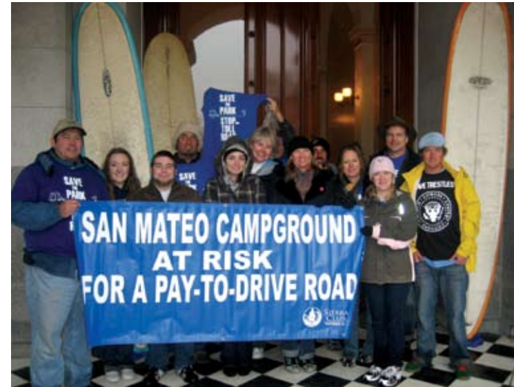
FRIENDS OF THE FOOTHILLS VOLUNTEERS FIGHT TO SAVE TRESTLES AND THE SAN MATEO CAMPGROUND

However, the road proponents have appealed the Federal Government requesting the decision be overturned. The Secretary of Commerce will oversee the appeal and will host a public hearing sometime during this summer.