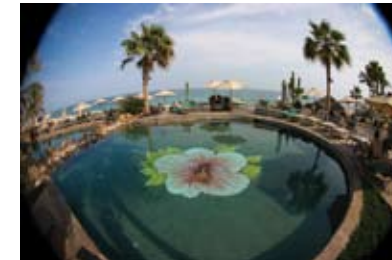
THE VIEW FROM THE SHERATON HACIENDA DEL MAR RESORT AND SPA - THE NEW VENUE WAS LOVED BY ALL