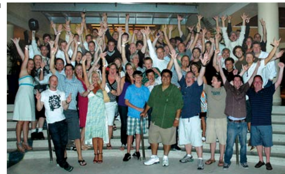
GROUP SHOT OF RETAIL ATTENDEES ON THE LAST NIGHT OF THE BRA SUMMIT IN PUERTO RICO.

With the support of the board sport industry and surf, skate and snow manufacturers, the Board Retailers Association (BRA) held a five day Retail Summit in San Juan, Puerto Rico, April 30th through May 4th. Retailers from across the country and Puerto Rico came together for educational seminars on topics ranging from merchandising to the current state of the board sport industry, interactive workshops focused on opening a dialogue between retailers and manufacturers, and networking opportunities where attendees had the chance to reconnect with old friends while building new relationships. While the primary purpose of the Retail Summit is to educate specialty retailers, the underlying result of the Summit was a shift of consciousness amongst all the retailers and manufacturers in attendance toward a more productive effort in promoting our business and the board sport lifestyle. For more highlights of the Retail Summit or to find out how to participate next year, please visit www.boardretailers.org .